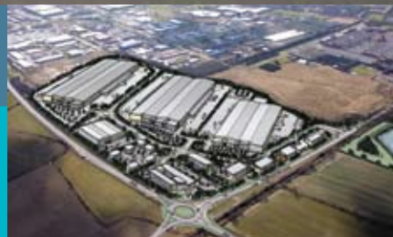
Masterplan Indicative Layout