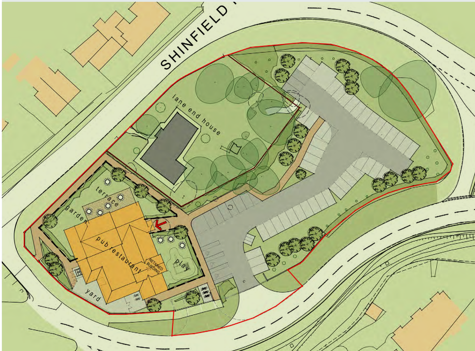
Previously Proposed Development