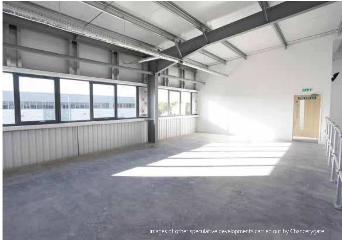
Images of other speculative developments carried out by Chancerygate