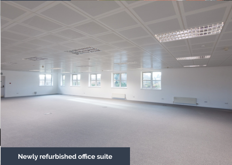
Newly refurbished office suite