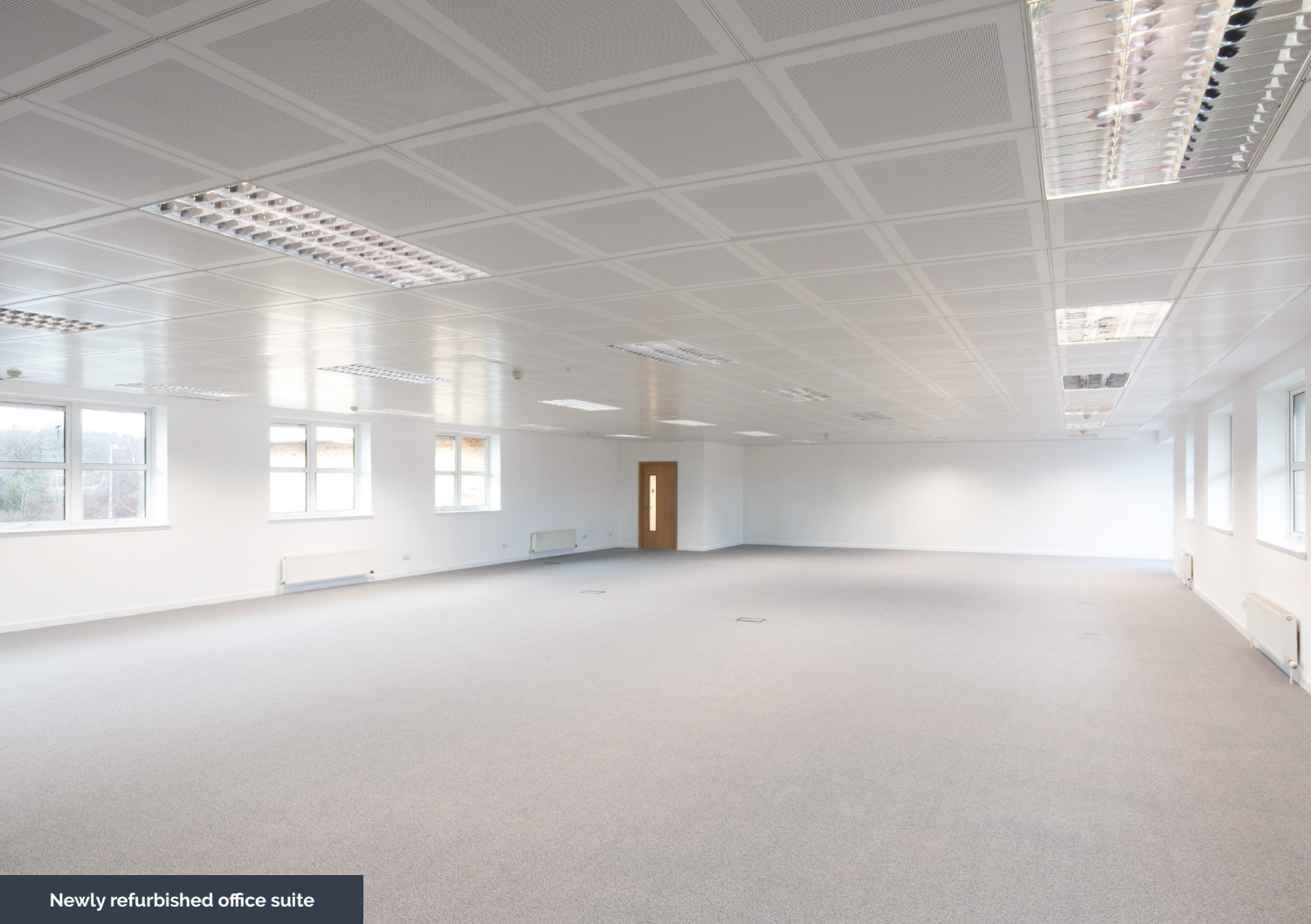
Newly refurbished office suite