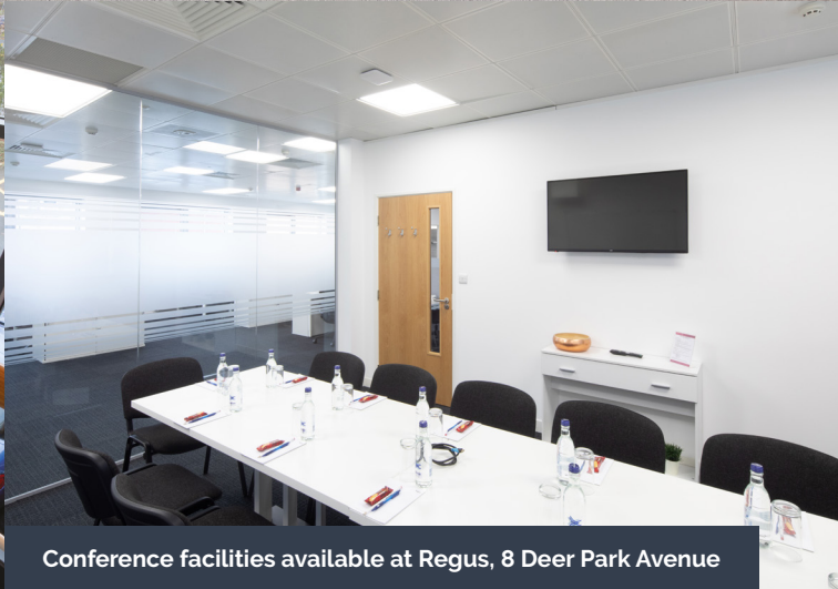
Conference facilities available at Regus, 8 Deer Park Avenue