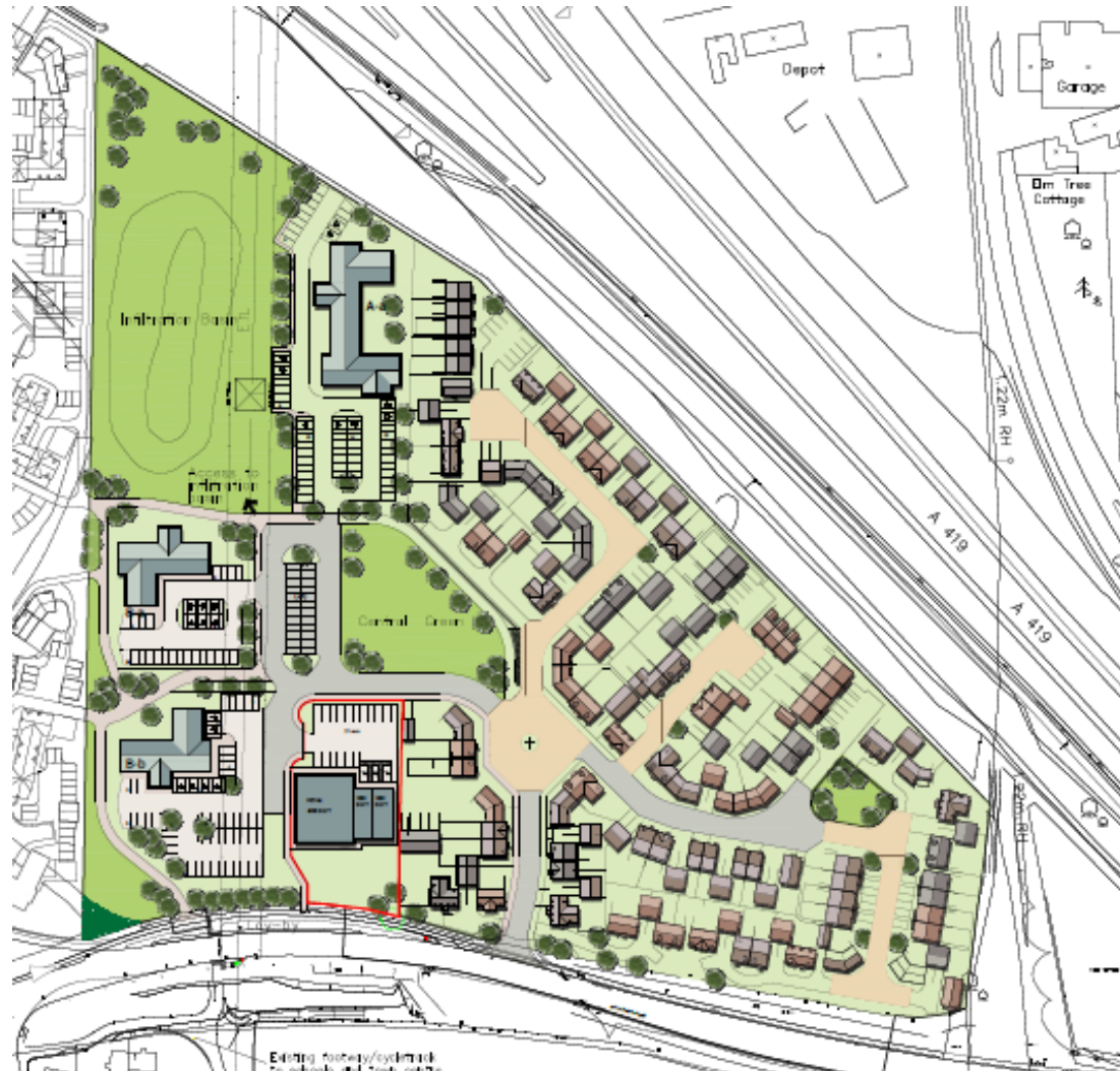
Kingshill 2 Proposed Site Layout