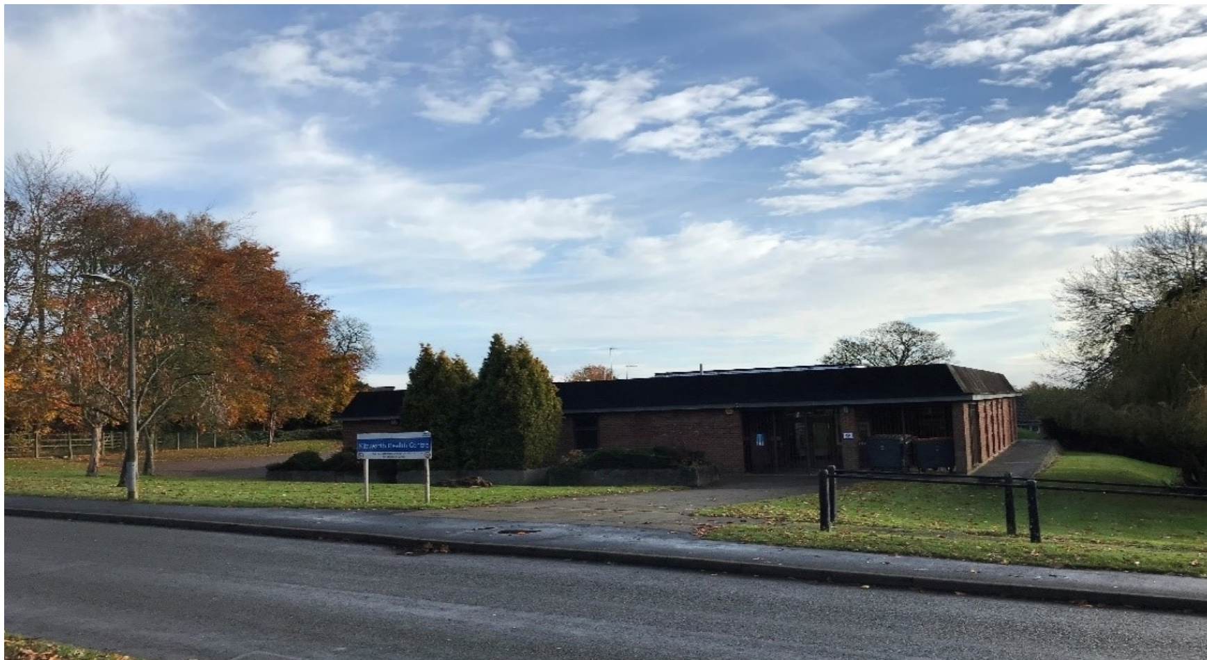
Kibworth Health Centre, Smeeton Road, Leicester, LE8 0LG