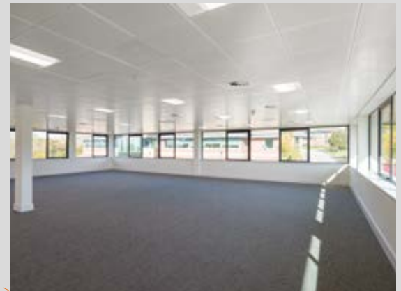
Indicative refurbishment - 8 Quinton Business Park