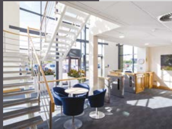
Reception to be refurbished