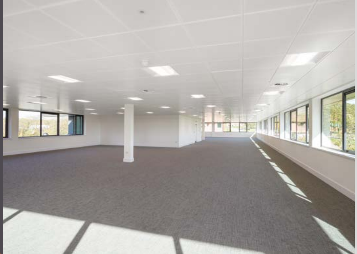
Indicative refurbishment - 8 Quinton Business Park