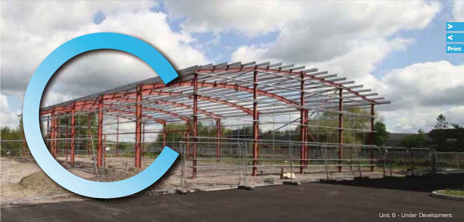
Unit 6 - Under Development

The scheme is located in an area of Chesterfield undergoing a period of dramatic change and renewal.