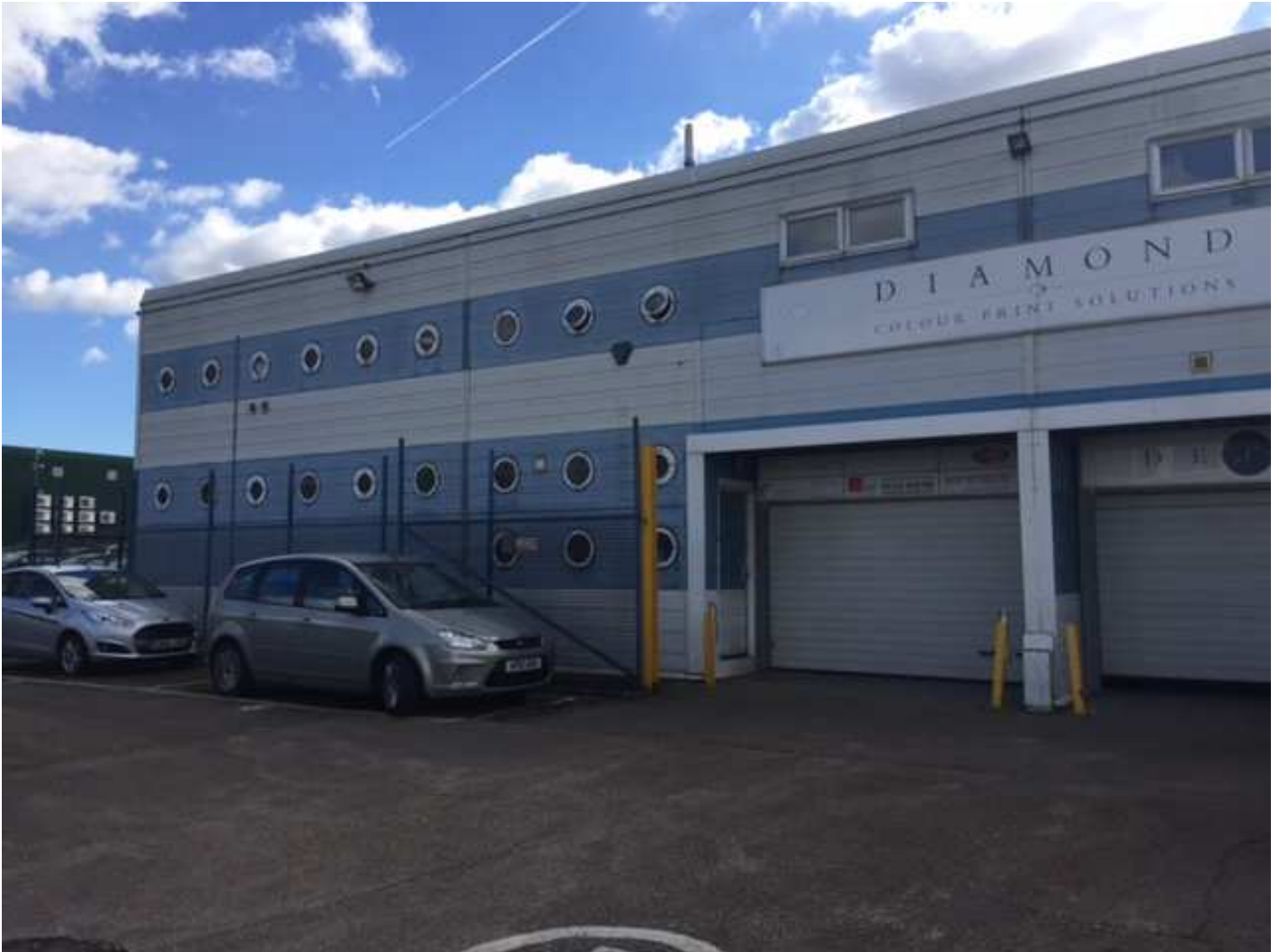
Photos of adjacent unit